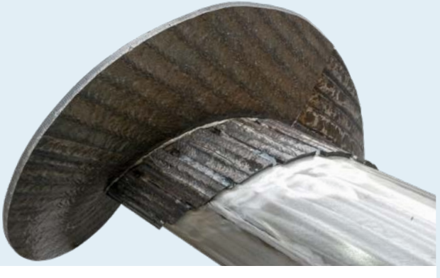
Screw conveyor shaft with wear protection for the paper industry