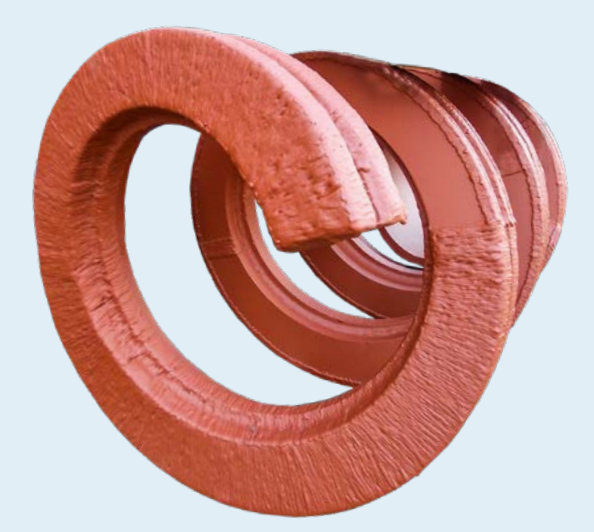
Screw conveyor shaft with wear protection for the glass industry