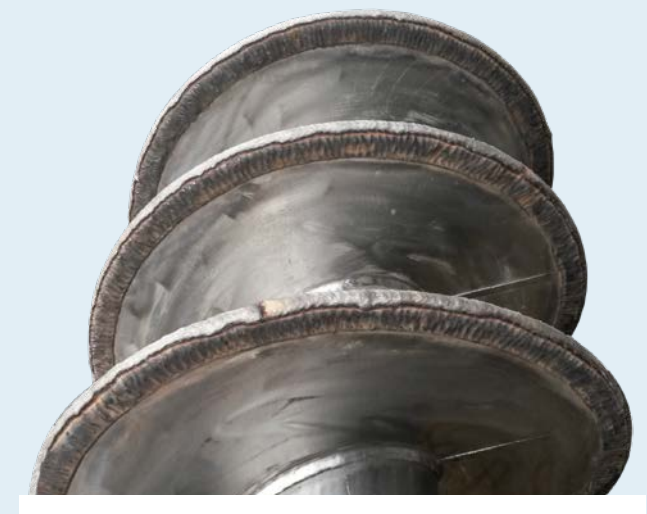
Screw conveyor shaft with wear protection for the sugar industry