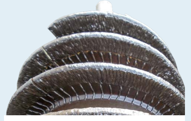
Screw conveyor shaft with wear protection for power stations

saves money by minimising costs and production losses due to wear