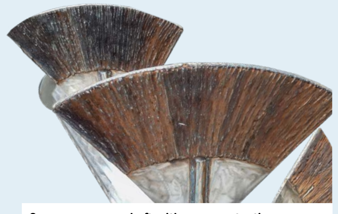
Screw conveyor shaft with wear protection for sewage sludge