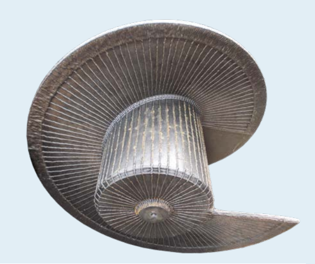
Screw conveyor shaft with wear protection for power stations